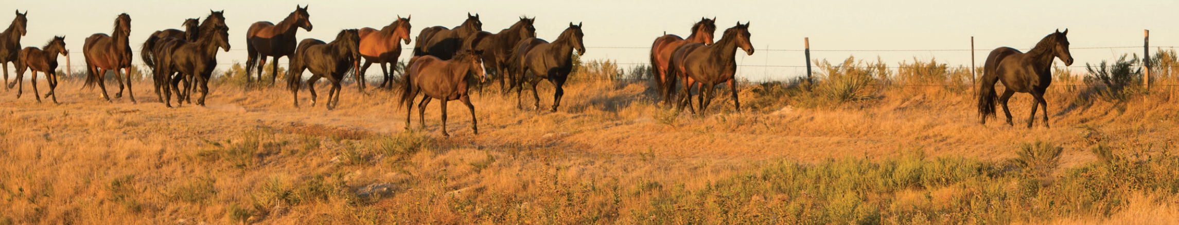
A herd of nearly 50 mares and foals graze the pasture below the main barn and corrals, where the horses gain sure-footedness needed to work cattle in the central Nebraska hills.